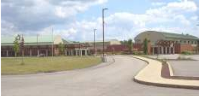
Economy Elementary School

Economy Borough is located in the Ambridge Area School District. Modern public elementary and junior high schools are located in Economy Borough on a spacious campus type setting.